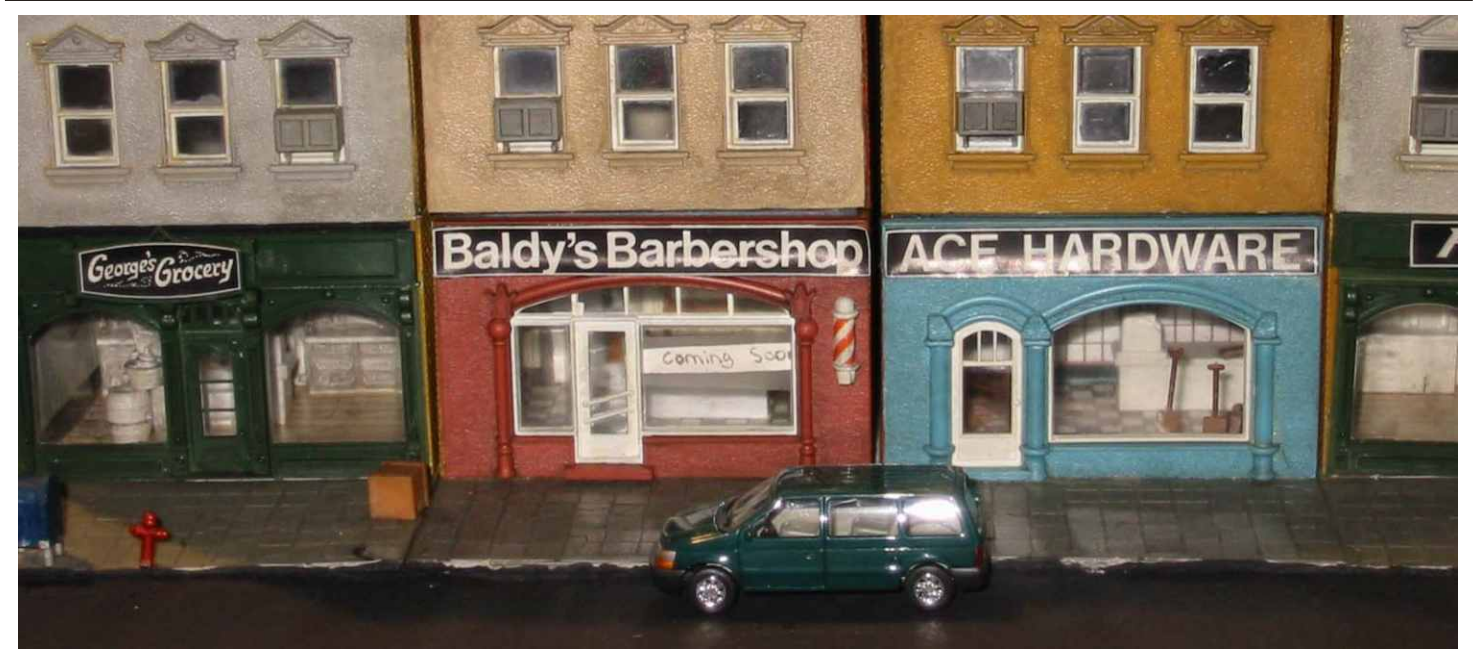
Viewers need to look closely to see the fine interior details on Greg Antonuccio's module, as seen at the HUB Division's Fall Show in Boxborough last November.

Headlight Printers Images and Ideas, Nashua, NH