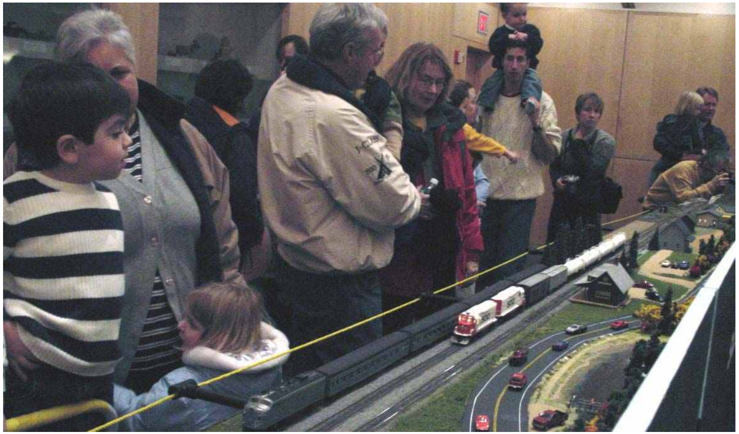
The HUB Division's Modular Railroad display at the National Heritage Museum in Lexington on December 13-14, 2003 was well attended, as this photo shows. Children found delight in the special Christmas Train with Hershey's kisses in its hopper, and with Thomas the Tank Engine.

The opportunity to capture the imagination of a young child and perhaps make him a model railroader for life does not come along often, so one should be prepared to act when it does. As representatives of the NMRA HUB Division, we would have been remiss for not recognizing this moment, whether it be in the United States, Canada, or in this case, the Netherlands.