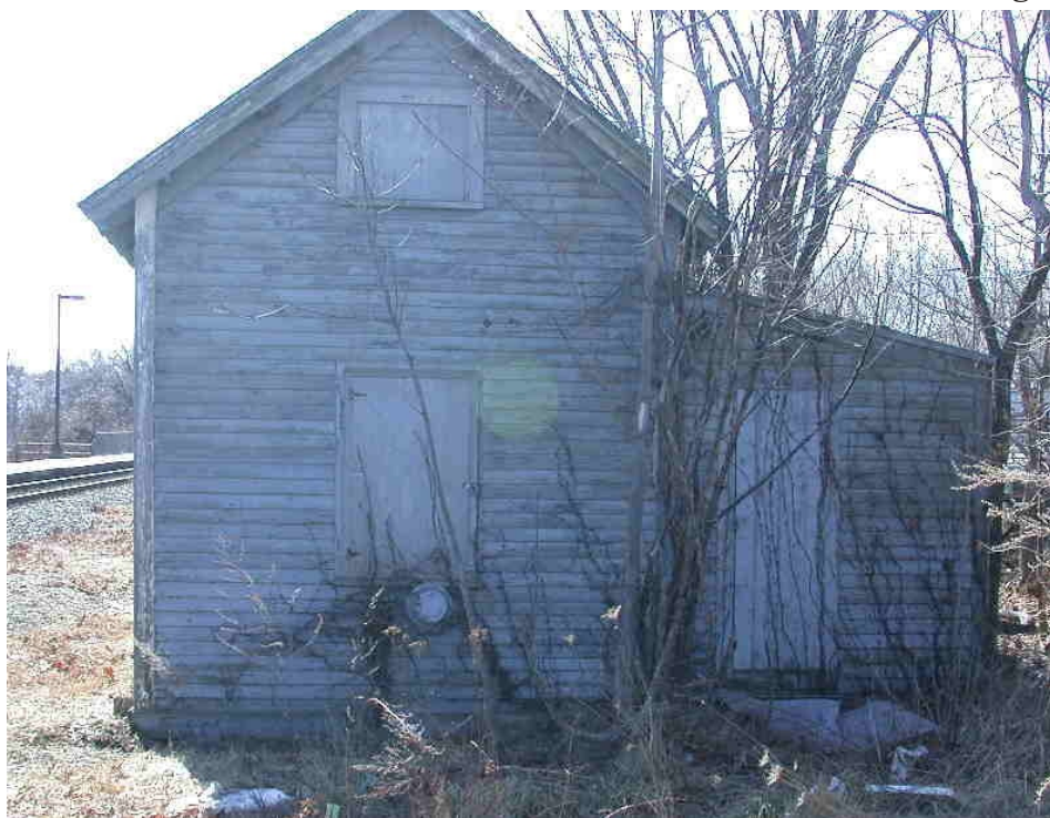
B&M's Ipswich, MA Section House

Why does this topic hit me every fall? Maybe it's because I see our fall show coming and I know the