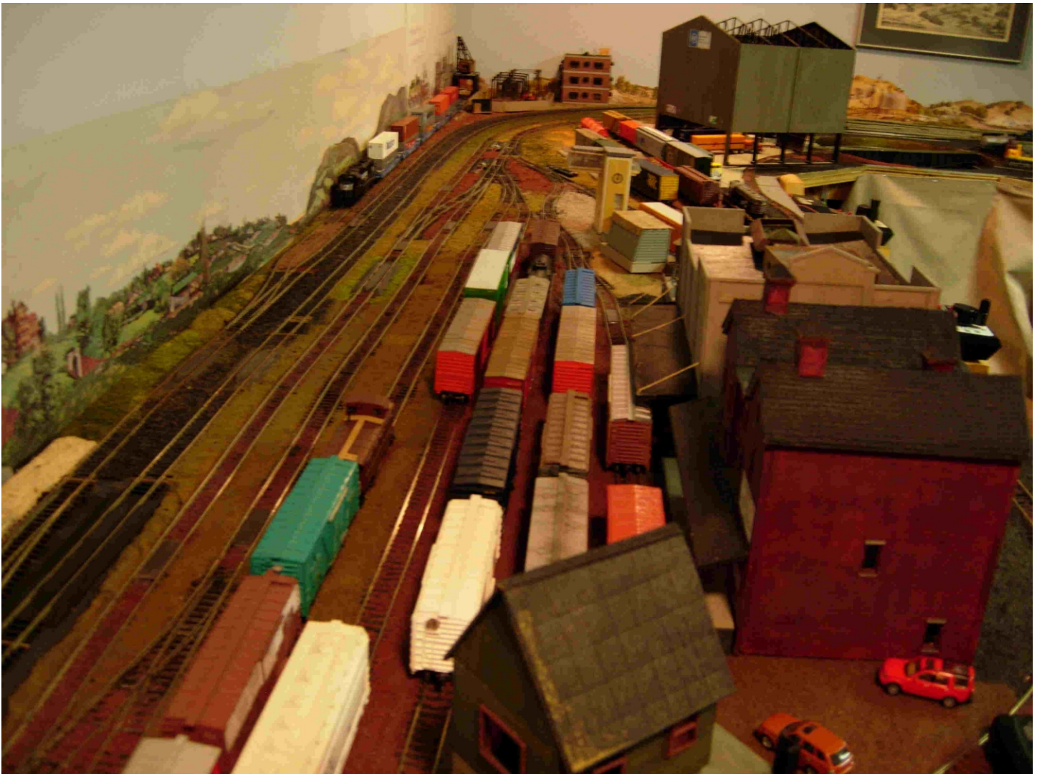
Cabot Yard on the Reading Terminal.

The next installment covers the Reading Terminal's system of operations.