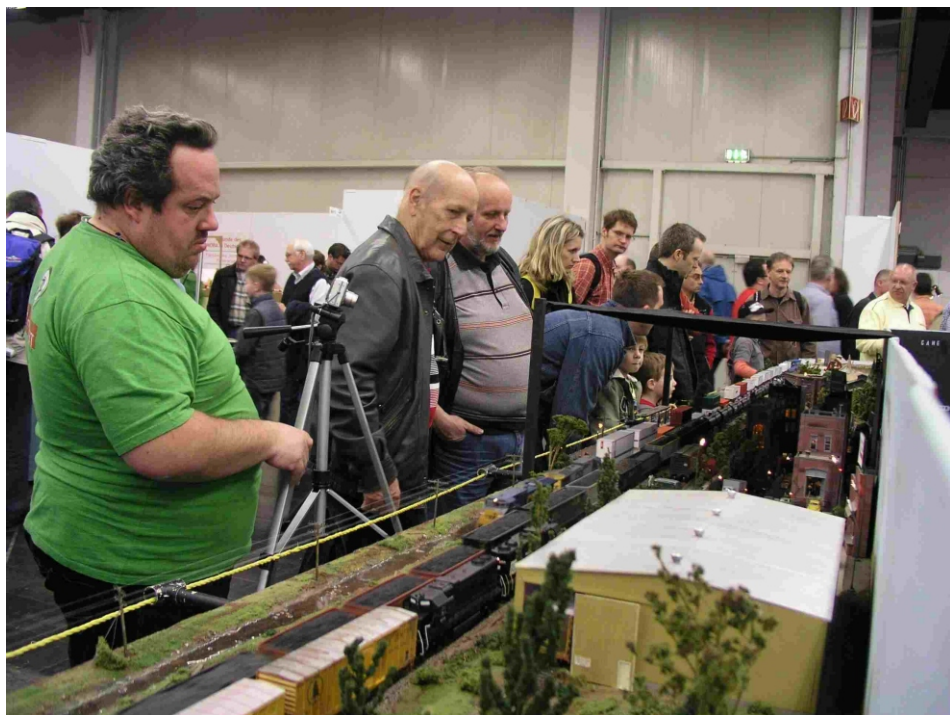
Photographs of the Hub Division's layout and viewers at the Dortmund, Germany Intermodellbau 2008 show were provided by Jeff Gerow.

One final note: all the equipment arrived safely in Germany with only minor and easily repairable tree damage on a couple of modules. It appears the laws of physics work even on scale trees, and who says there is no such thing as a micro-tornado?