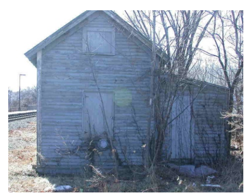
B&M's Ipswich, MA Section House

year, the squirrel industriously stores his needs for the winter and lives to survive and thrive another vear. November, which is Model Railroading month, needs our attention to also survive and thrive for another year. It won't happen without your help. Whether you chose to make a tax deductible donation to the HUB, volunteer your time to assist at our fall show or give a clinic, the time is now to give something back to the hobby. So go out, become involved with your fellow model railroaders. If the truth be known, railroading itself is not an individual profession practiced in isolation; rather it is a team of people working together to provide a service for others. So join the HUB team this fall and help make model railroading more