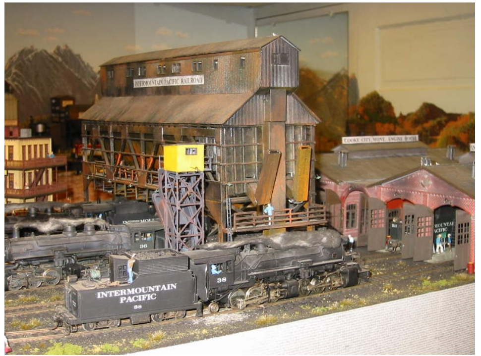
The Cooke City coaling tower and engine house dominate the scene of Jack's engine terminal.

I didn't want a roundhouse for the They take up so much engines. room. I kit-bashed a pair of Walthers 2-stall engine houses into a 5-stall building by constructing a flat roofed fifth stall between these two units. I had some old Revell engine house doors and an archway that worked for the center track. A piece of 0.020 styrene sheet was used for the roof. In order to provide good interior views, I used partial walls outside and used some surplus wall stock to fill in the back of the middle stall. I ran tracks 2 and 4 through the back wall, since the kit provided some extra doors. In addition to a dozen workmen inside, I added two jib cranes, a lathe, drill presses, generator, welding tanks, a pair of step ladders, and lots of barrels. The floor was painted concrete color and weathered with real coal dust. Since the scene is 55 inches above the floor and near the layout edge, it offers great views to the inside.