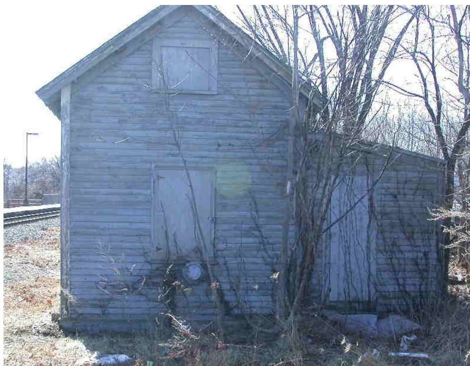
B&M's Ipswich, MA Section House

At any rate, the Amherst Springfield show is behind us, so too