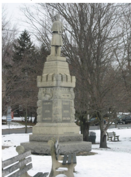
The prototype Civil War monument, next to the Town Hall in Essex, MA, dedicated in 1905.

Voila! A 1/8-inch to the foot scale model of a New England Civil War monument was finished and ready to use at the next train show.