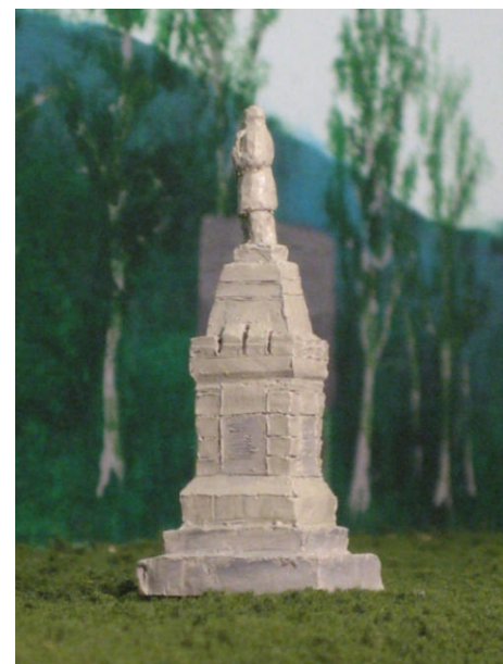
The finished model of the monument, viewed from the right rear. The soldier's back faces the public side of the module.