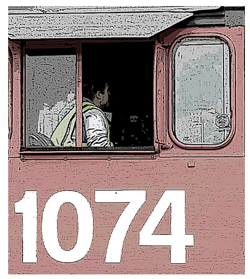
This photo shows an example of what is possible with Photoshop filters, used here to make the photo resemble a silk screen or lithograph. The photo was entered by Mike in Photo Contest held at the Palmer Convention.

Even though rules are meant to be broken by creative workers, the first part of this presentation will be a PowerPoint show presenting problems and solutions for close-up photography. Selection of a suitable camera, software for model photography and classic techniques for photographic lighting and exposure will be discussed. Simple "Photoshop" techniques for enhancing images will round out this part of the clinic. A live demonstration of indoor photographic lighting will follow. Those who are interested may bring along their cameras and a model that may be shot using studio lighting. Although any camera will work, a camera with adjustable settings (such as an SLR) is preferred.