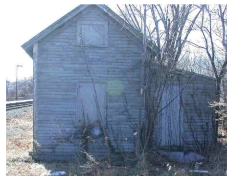
B&M's Ipswich, MA Section House

year, the squirrel industriously stores his needs for the winter and lives to survive and thrive another year. November, which is Model Railroading month, needs our attention to also survive and thrive for another year. It won't happen without your help. Whether you chose to make a tax deductible donation to the HUB, volunteer your time to assist at our fall show or give a clinic, the time is now to give something back to the hobby. So go out, become involved with your fellow model railroaders. If the truth be known, railroading itself is not an individual profession practiced in isolation; rather it is a team of people working together to provide a service for others. So join the HUB team this fall and help make model railroading more