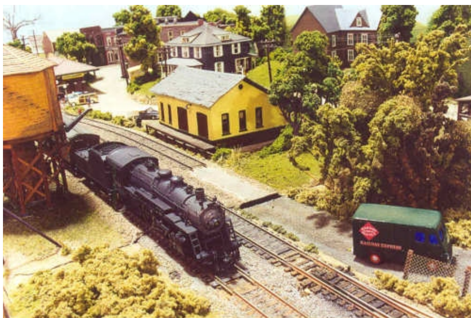
The Ames' award winning Brockwayville module depicts a small town and the station that connects it to the rest of the country by rail. The water tower appears on Lyle Sorenson's Brockway Mills module.

warehouse to await sharing a container with other goods, a barge ride from Boston to New York, and probably shipment topside as a light container during the rough winter storm season in the North Atlantic. The time element works against you on both ends, and since most of us are also active participants in many of the HUB fall show activities, we felt tying our equipment up for perhaps three months was not a viable option. Once the flight plan was chosen we weighed one module boxed in the prototype container (approximately 110 pounds), multiplied by 15, and got our price quotations while Jeff began making arrangements for the "Carnet." The Carnet is a shipping document, which travels with the freight and must be signed at each step of the way. We were lucky that our host Don had a contact, Ad van Genderen, within the trucking industry in the Netherlands, who handled all the arrangements between Amsterdam and the show in S'Hertogenbosh. Otherwise there