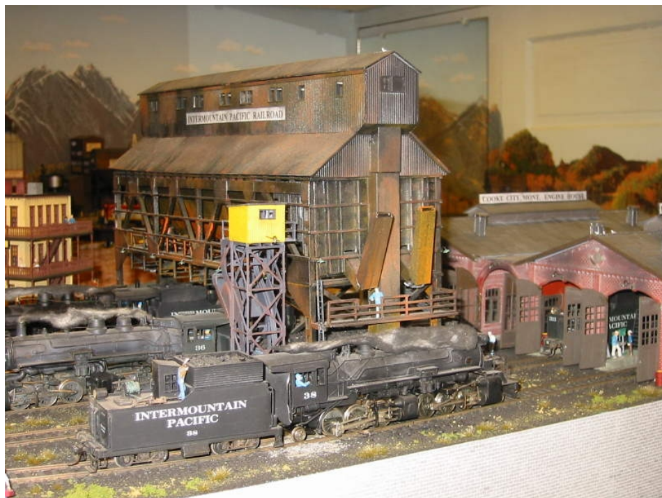
The Cooke City cooling tower and engine house dominate the scene of Jack's engine terminal.

I didn't want a roundhouse for the engines. They take up so much room. I kit-bashed a pair of Walthers 2-stall engine houses into a 5-stall building by constructing a flat roofed fifth stall between these two units. I had some old Revell engine house doors and an archway that worked for the center track. A piece of 0.020 styrene sheet was used for the roof. In order to provide good interior views, I used partial walls outside and used some surplus wall stock to fill in the back of the middle stall. I ran tracks 2 and 4 through the back wall, since the kit provided some extra doors. In addition to a dozen workmen inside, I added two jib cranes, a lathe, drill presses, generator, welding tanks, a pair of step ladders, and lots of barrels. The floor was painted concrete color and weathered with real coal dust. Since the scene is 55 inches above the floor and near the layout edge, it offers great views to the inside.